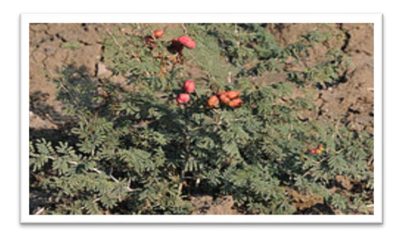
Figure: (1) Prosopis fracta flowers and fruit